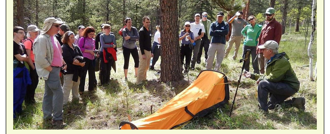
WSS bivy shelter discussion.